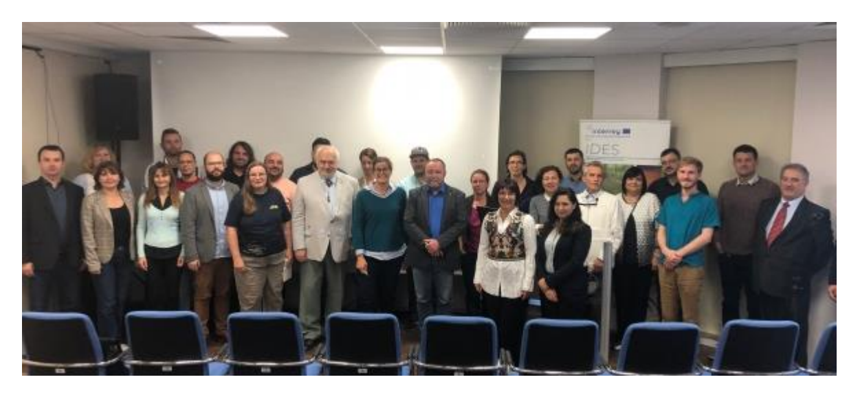
{\it The participants of the IDES International\ workshop}

The workshop was useful both for information and for discussing issues related to the results and impacts of the IDES project with the project partners and stakeholders present. Participants' comments and questions helped to shape the project's progress and next steps.