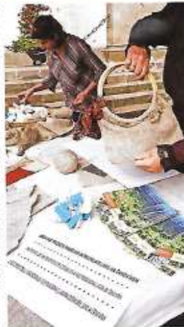
Presentation by Geopark partners in Abbadia San Salvatore.

The ESTEAM project, co-financed by the Erasmus+ Programme of the European Union, involves the leading partner Idrija UNESCO Global Geopark (Idrija Heritage Centre), Magma Geopark and Naturtejo Geopark, one primary school from each of the three geoparks – Čmi Vrh primary school (Slovenia), Samfundets Skole (Norway) and Jose Silvestre Ribeiro (Portugal) – as well as the University of Ljubljana (Slovenia) and Localify (Iceland) a company creating branded apps. The project started in September,